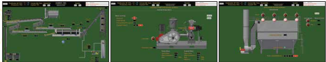
Interface screen shots

Compatible with all plant manufactures and configurations.